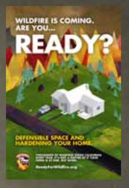
Step 1: Is Your Home Ready?

Creating defensible space and hardening your home against wildfire.